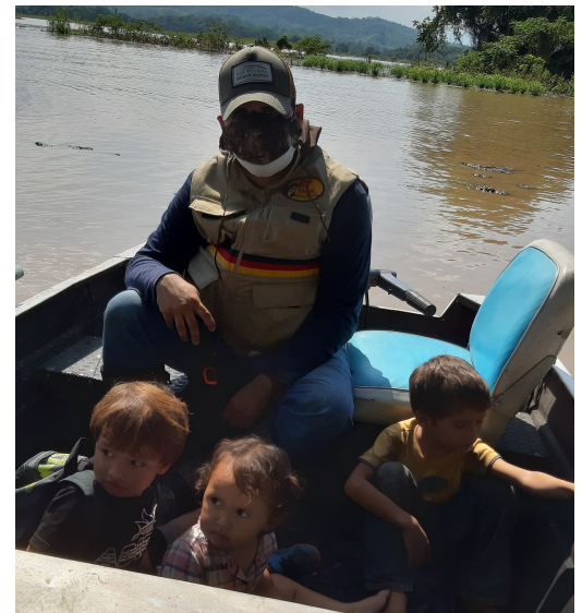
Family seeks shelter, November 2020