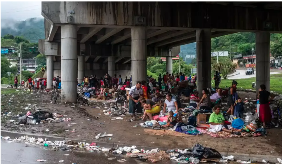
Hurricane Eta 's aftermath in Honduras, November 2020

Funds were used to purchase food, water, hygienic products, clothing, medication, and PPE (personal protective equipment) for San Pedro Sula shelters.