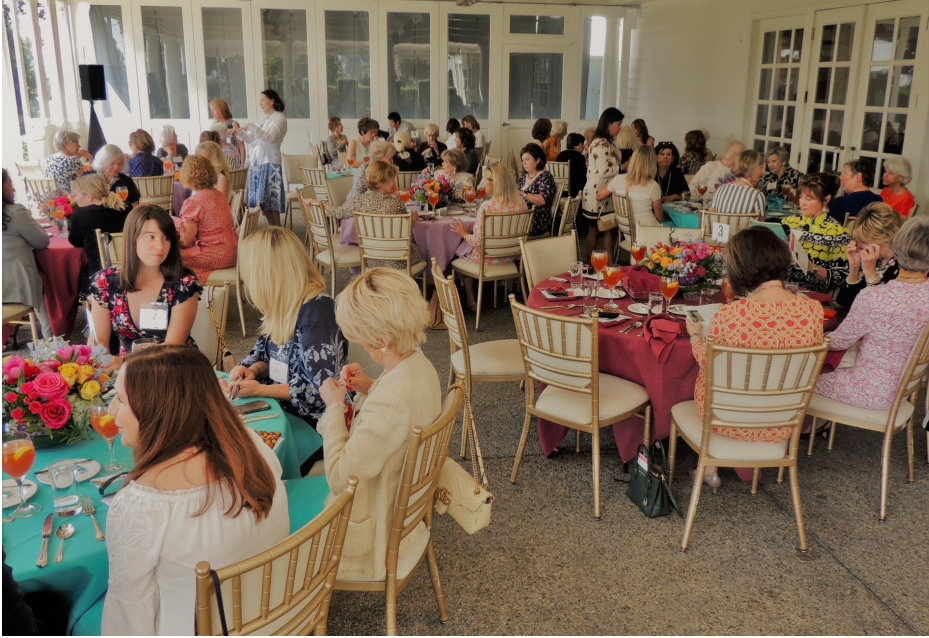
Guests at the 2021 Angels' Luncheon